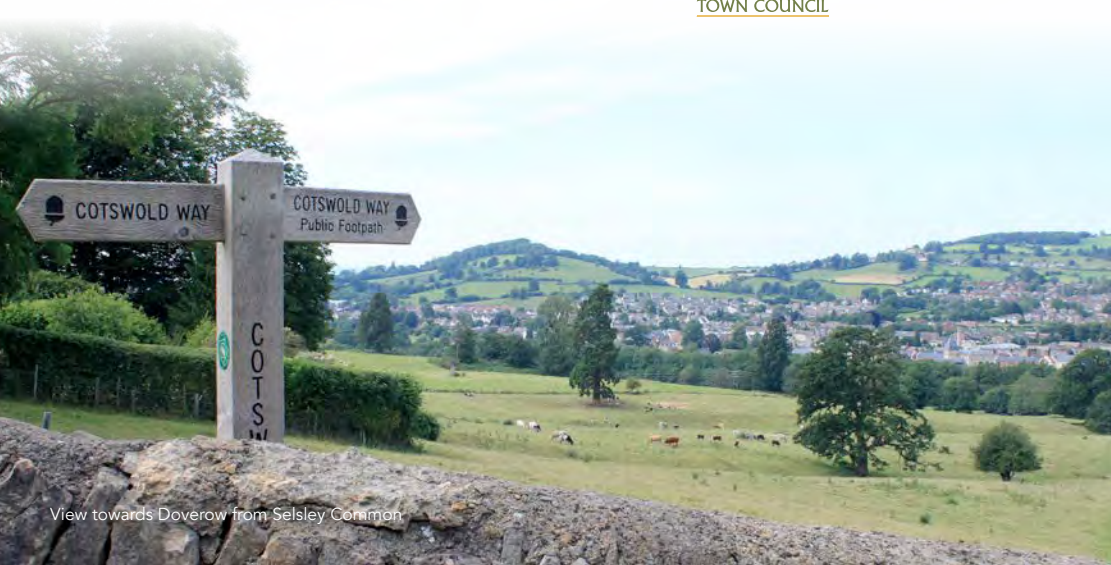
View towards Doverow from Selsley Common

Please read the guidelines on the back cover of this booklet before attending any of our walks.